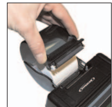
No-jam clamshell, integrated printer