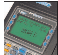
Customizable GUI display