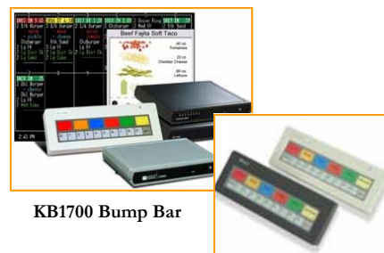
KB1700 Bump Bar

Bump Bars are essential in the quick service restaurant arena. A bump bar system provides a visible and paperless way to present orders. Many quick service restaurants, such as Dairy Queen, won't consider a POS that doesn't support bump bars. One great advantage of a bump bar is displaying the order 'in progress', as it is being rung up, so kitchen staff can start preparing the order immediately.