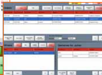
Delivery & Driver Tracking

For more details on Pizza & Delivery call us, Or visit us online.